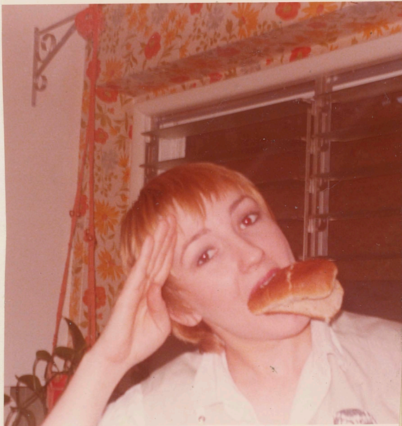
She ate - I ate.