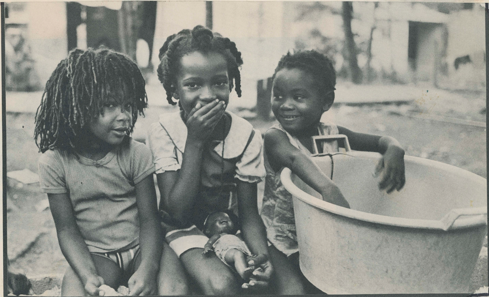
Peace, love, and praises make smiles.

the mothers of families, read these leaves in the open air every season of every year of your life, re-examine all you have been told at school or church or in any book, dismiss whatever insults your own soul, and your very flesh shall be a great poem and have the richest fluency not only in its words but in the silent lines of its lips and face and between the lashes of your eyes and in every motion and joint of your body."