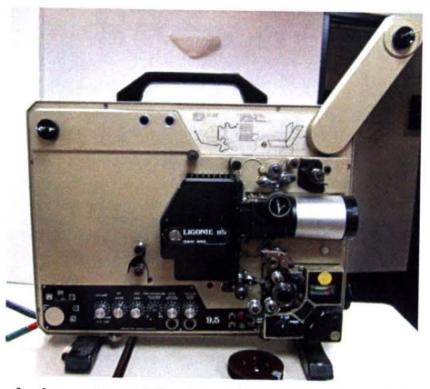
A close view of the French Ligonie OSM 950 model that was used

As the number of competition films can now be shown in a single session, a celebration of digitally made films were presented on the first evening (Thursday) The number included was again a dozen. Most of these came from the