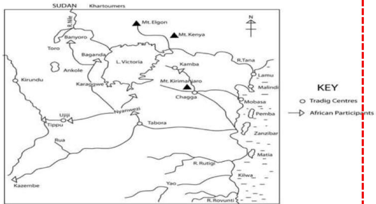
A sketchmap of East Africa showing the African participants in slave trade

The role of Khartoumers: These were Egyptians and Sudanese traders who dealt in ivory and slaves. They were semi-official representatives of the Egyptian government with several hundred armed men in their pay. Banyoro, Buganda and Bunyoro were enemies, kabakaMutesa I stopped slave traders from going to Bunyoro. However, they dealt in backcloth, slaves and salt.